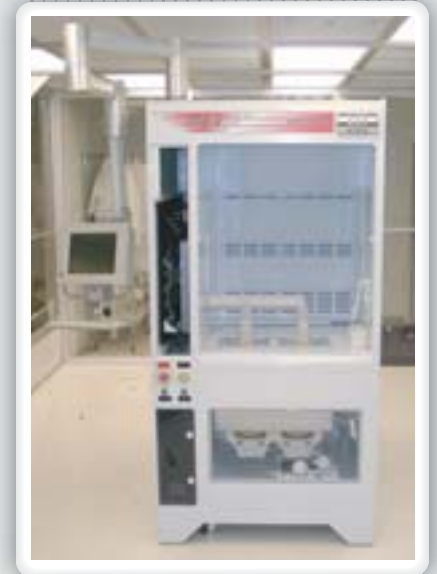
New MEI Advancer strip bench utilizing tanks and filter recirculation pumps from system being replaced.